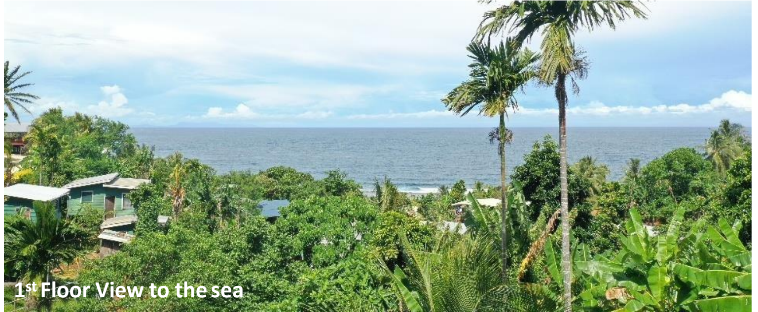
1 st Floor View to the sea